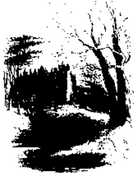
Illustration by Phiz (with apologies) from the frontispiece of Bleak House by Charles Dickens

Come to the Village Hall at 7.30pm on Saturday 3 November to hear some ghost stories suitable for the Hallowe'en season, retold in readings by village thespians, including youngsters, with interludes from Sine Nomine Singers.