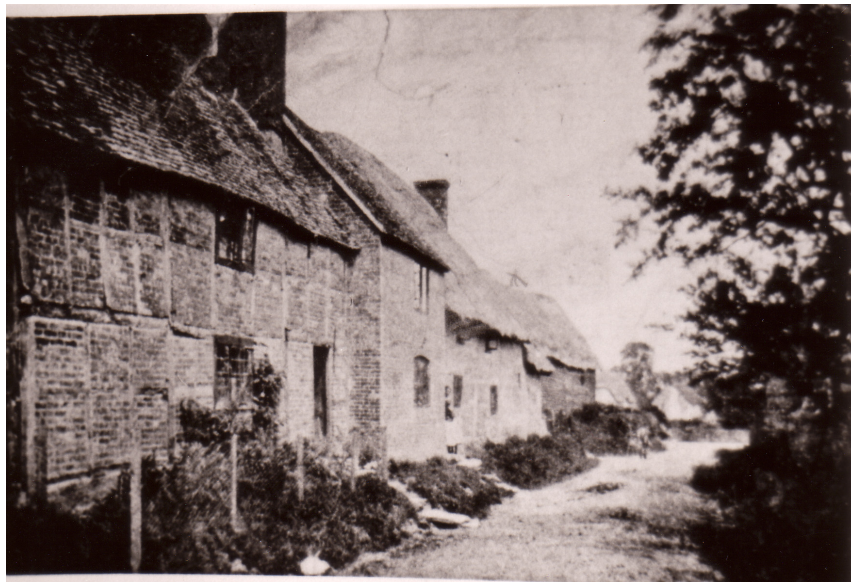
THE VILLAGE A CENTURY AGO Stream Road viewed from the bottom of Pound Lane, looking towards the Crossing, where a plaque still commemorates a tree planted for the coronation of King Edward VII in 1902.