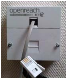
New BT Infinity faceplate