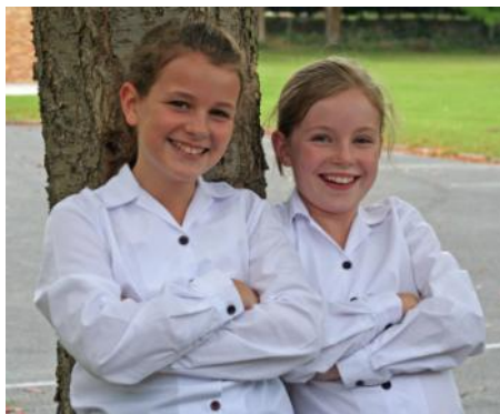
Two of our contributors