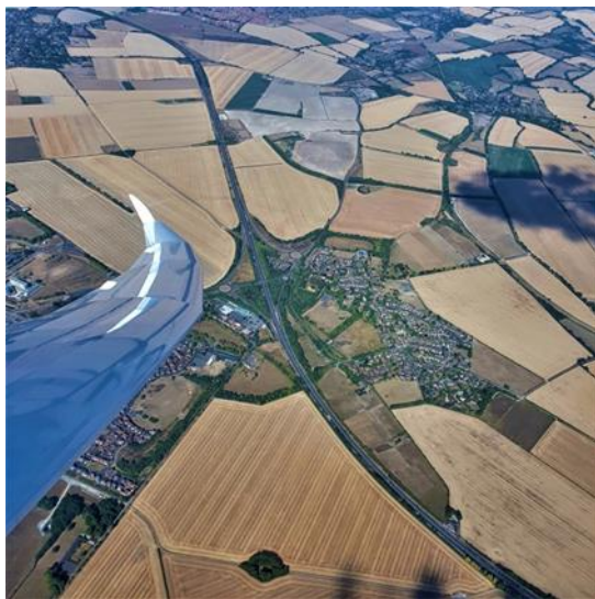
Previous entry - Upton from above

Remember to include a brief description or title.