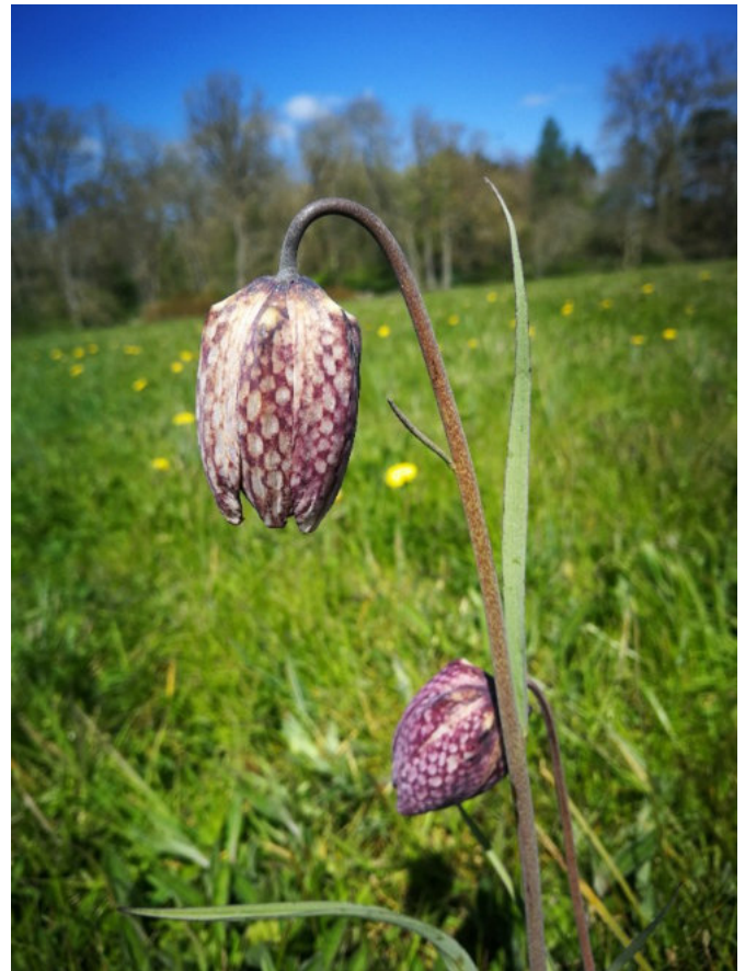
Snakes-head fritillary; Sophie Cunnington, Wild Oxfordshire

However, you can, of course submit via iRecord observations from beyond the activity area, and historic observations (as long as you still have the relevant information to hand). For greatest efficiency, we recommend that anyone who is interested in contributing to this effort, or perhaps already keeps records of observations but has not shared them, creates their own iRecord account and uses that to record their sightings. There is an option to start in “ training mode ”, which allows you to get used to the system of submitting records without risk of causing any damage! And even in live mode, iRecord uses a system of checkers to assess records, so that the risk of erroneous records getting on the official record is minimised. You can also attach photos to records to assist with this.