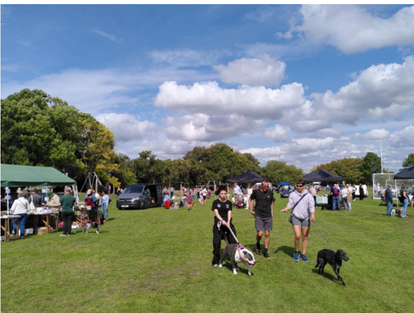
Upton Village Fete (Peter McLaughlin)