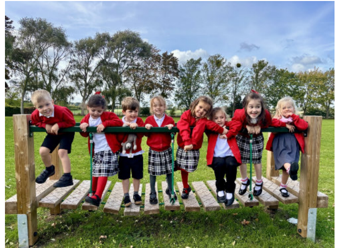
The class of 2025